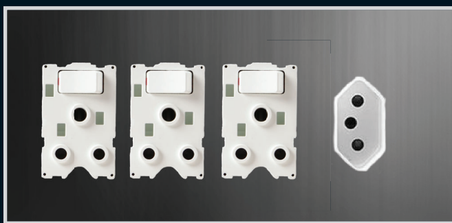
SA Euro Socket