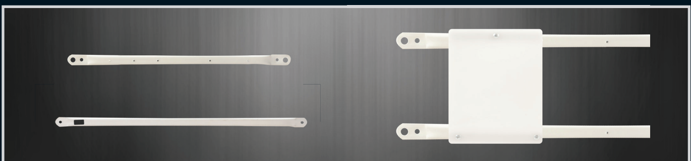
Rails with Perspex Meter Mounting Point