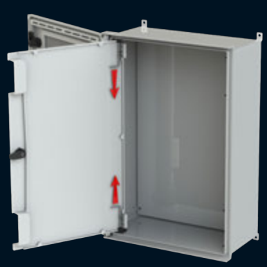
1) To remove or place the inner door in an Allbrox® simply pull the two hinge pins as indicated towards each other.